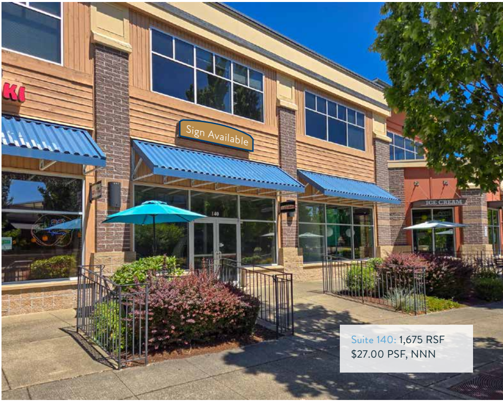
Suite 140: 1,675 RSF $27.00 PSF, NNN