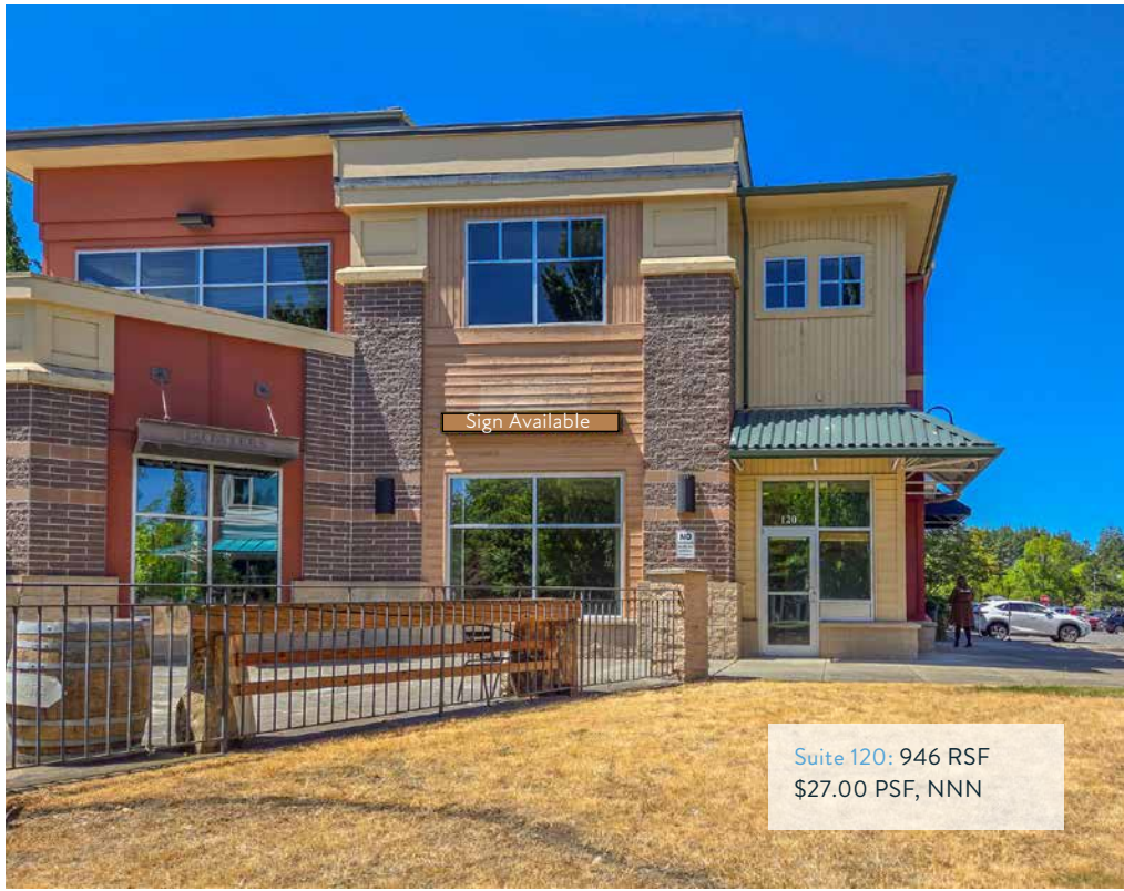
Suite 120: 946 RSF $27.00 PSF, NNN