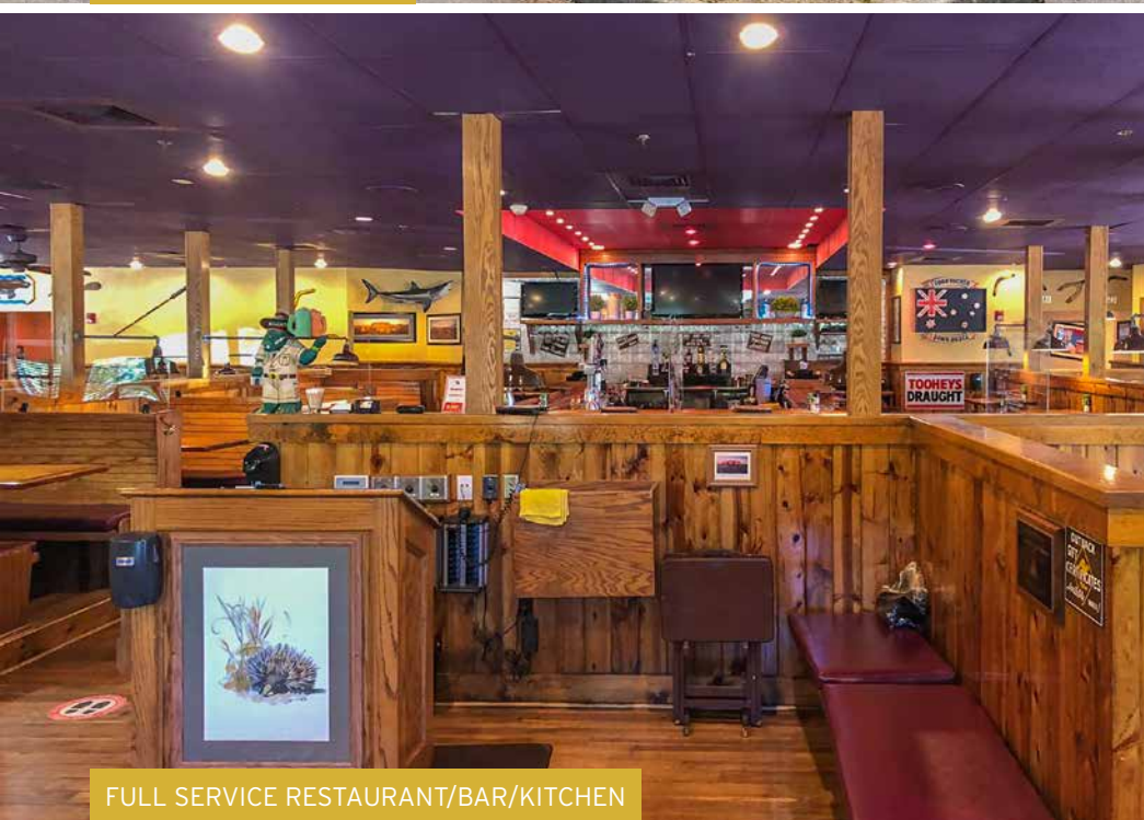
FULL SERVICE RESTAURANT/BAR/KITCHEN