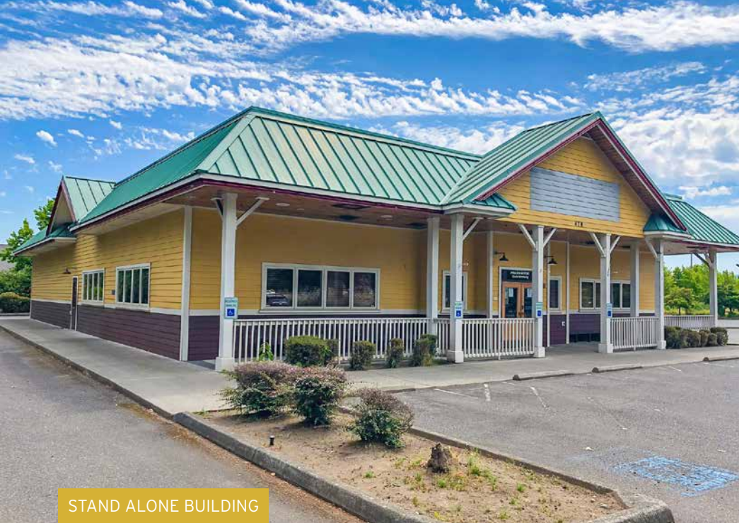
STAND ALONE BUILDING