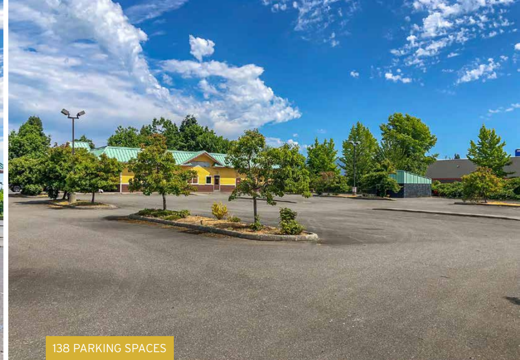
138 PARKING SPACES