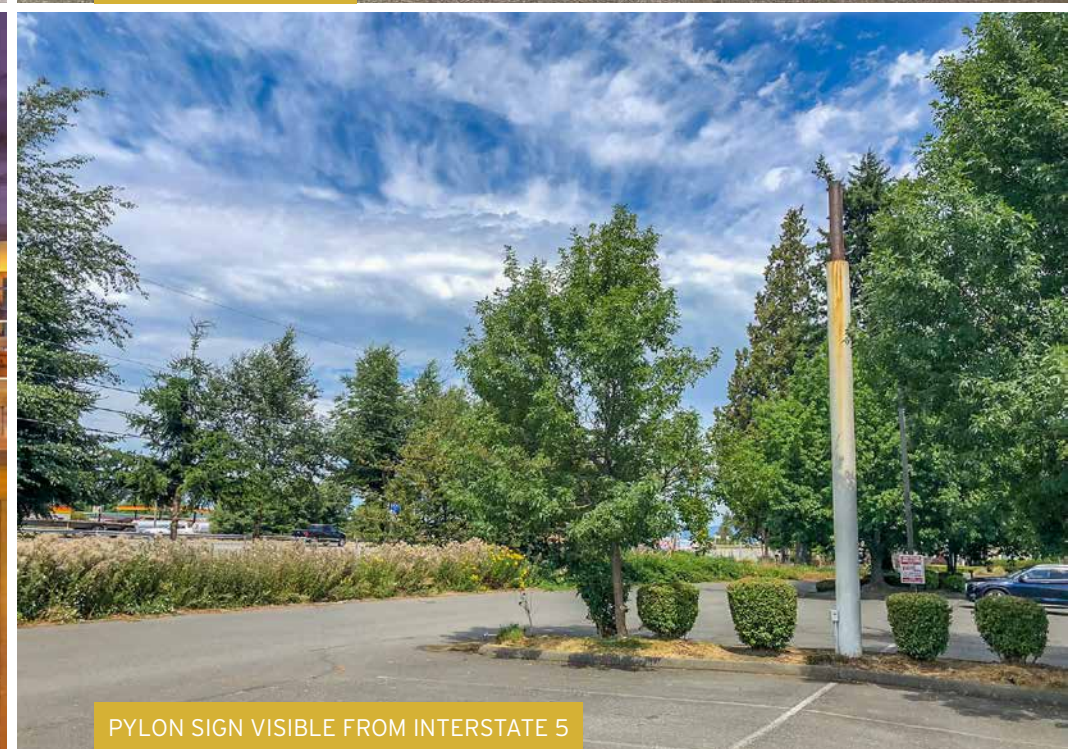
PYLON SIGN VISIBLE FROM INTERSTATE 5